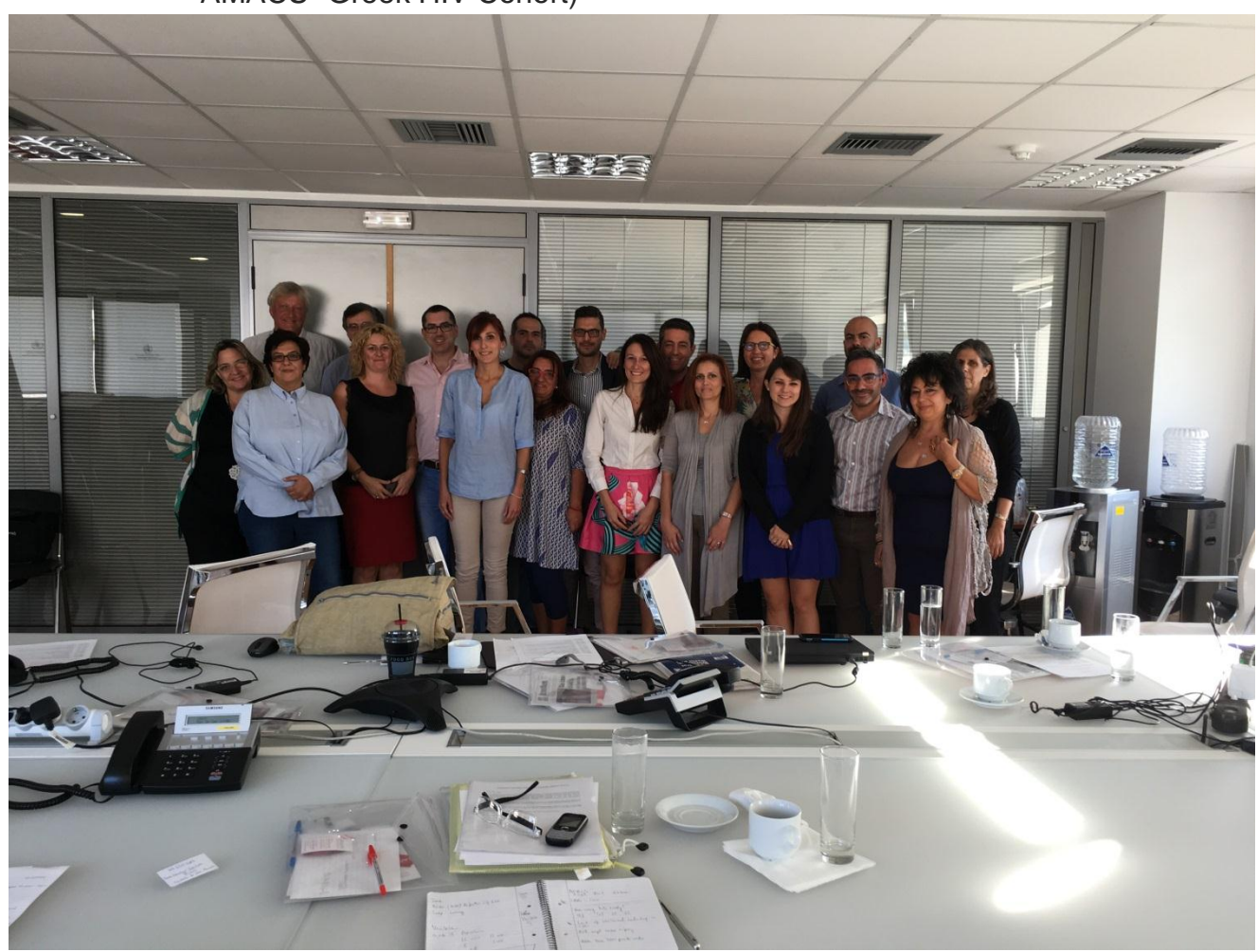
Statistics, Medical School, National & Kapodistrian Uni. of Athens, "AMACS" Greek HIV Cohort)