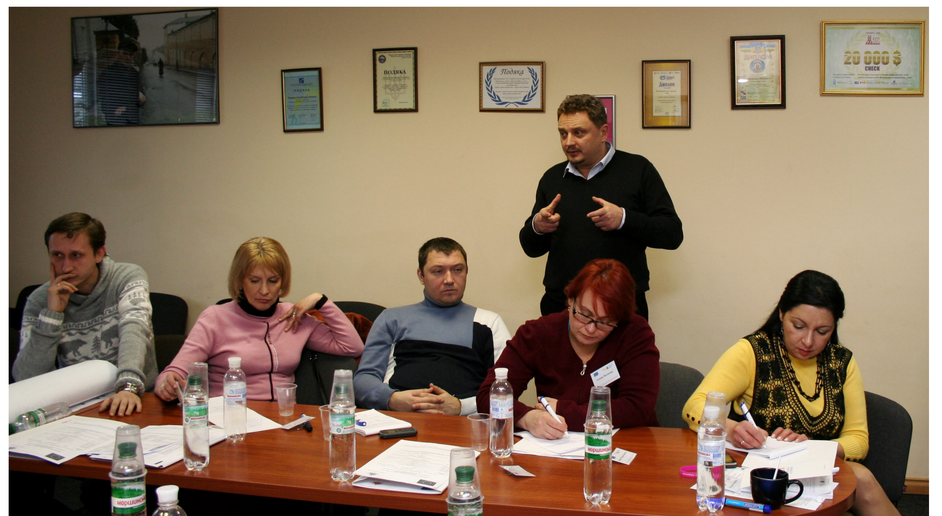
Training in All-Ukrainian Network of PLWH Kyiv, Ukraine